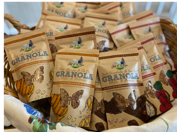
The bags of all-natural granola, each packed with a small card bearing a photo of a resident and a bit of her story, are sold at various stores and restaurants in several states, on line, at Whole Foods, and more recently at Publix.

Blue Monarch Children. “Severe trauma and sexual abuse have increased exponentially during