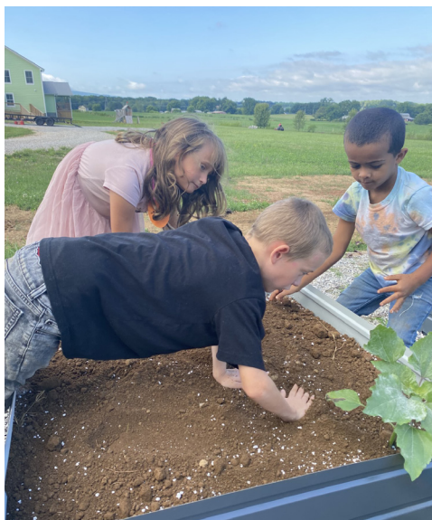
The Proverbs 22:6 Children’s Program, dedicated to providing the richest experience possible by focusing on specific needs of every child, including regular assessments, tutoring, mentoring, and age-appropriate counseling.